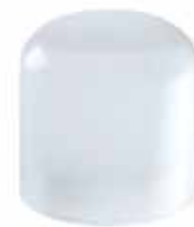
Figure 1: The CARTIVA SCI implant

The CARTIVA® Synthetic Cartilage Implant (CARTIVA SCI) is a man-made (synthetic) implant that is made of a soft plastic-like substance (polyvinyl alcohol) and salt water (saline). These materials are combined and molded into a solid, slippery and durable implant. Figure 1 shows a picture of the CARTIVA SCI. The implant replaces the damaged cartilage surface of the big toe.